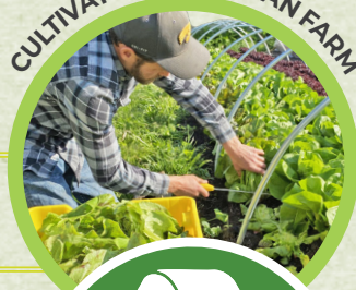
CULTIVATE HOPE URBAN FARM

1) Cultivate Hope Urban Farm grows produce.